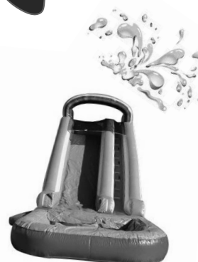
Water Bouncy House