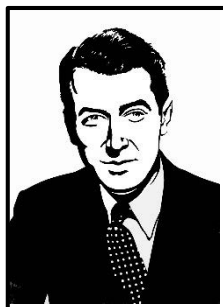
James M. Stewart May 20, 1908 – July 2, 1997

To all Veterans in Peoria County if you need any assistance please contact the Peoria County Veterans Assistance Commission at (309) 681-2554.